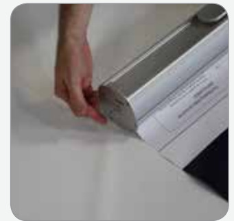
6. Press graphic on firmly. Remove pin on side of base and slowly let the graphic slide into base.