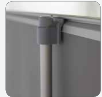
9. Slide graphic up. Latch onto top of pole and reinsert pin into base to secure graphic.